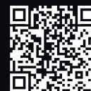
RUT241 360° VIEW

// RUT241 is the modified version of our all-time bestseller RUT240 that inherited its' best features, including industrial design, compact size, multiple connection interfaces, and compatibility with RMS.